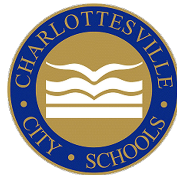
Virtual Student Enrollments June 2022