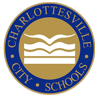
Enrollments into Virtual Virginia 2022-23