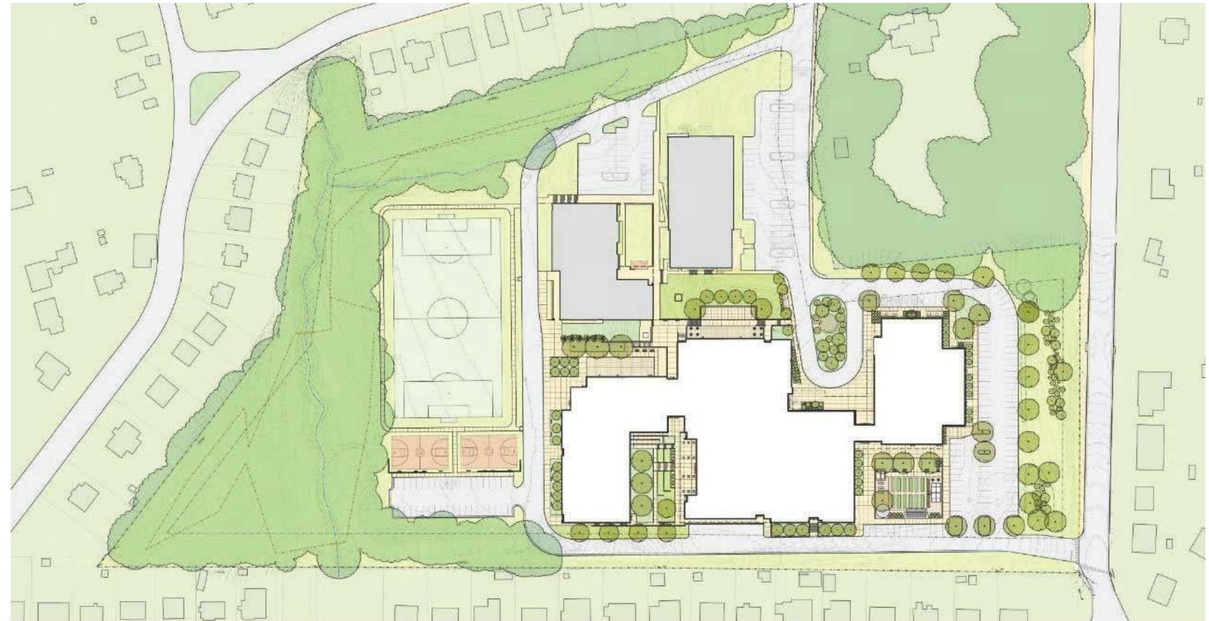
Site Plan – Schematic Design Base Estimate