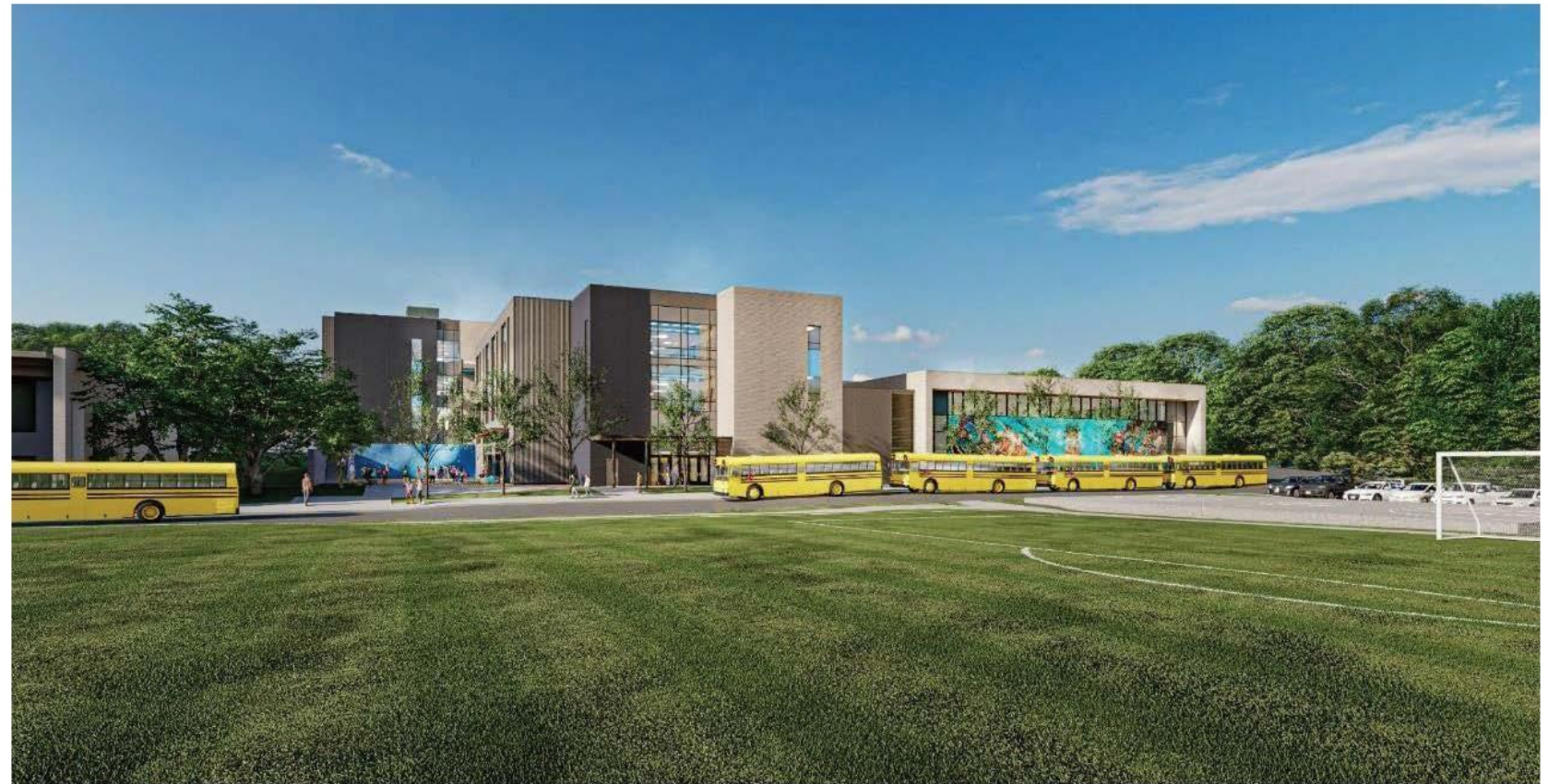
Schematic Design – Field View