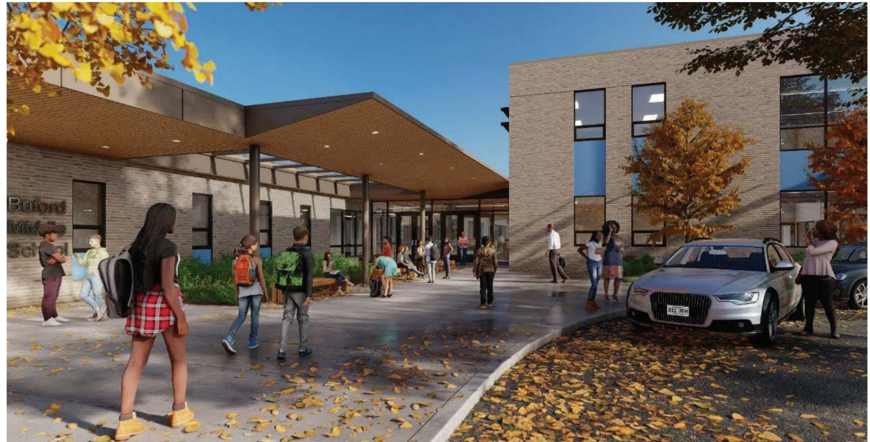
Schematic Design – Main Entrance View