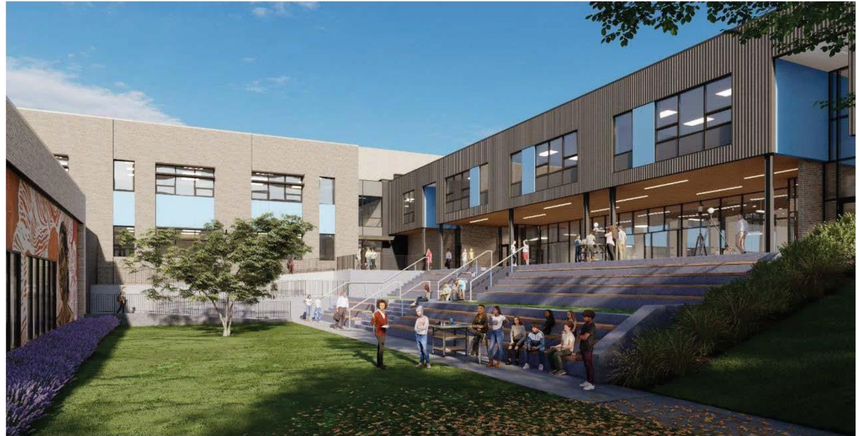
Schematic Design – Dining Terrace (Base Estimate)